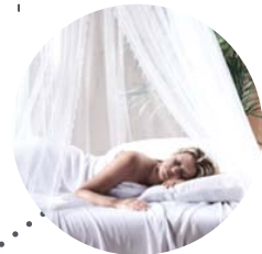
Cosy king-size bed* (optional)