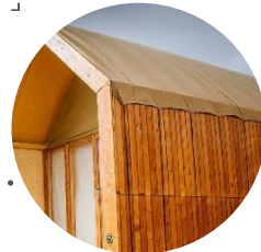
Waterproof roof canvas & wooden facade