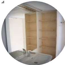
Wooden functional cabinet