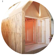
Full front plexi glass wall with direct access to terrace